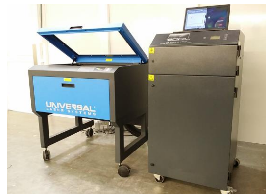
Laser Material Processor