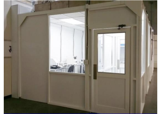
Cleanroom ISO 6 (Class 1,000)